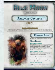
1 ADVANCED CONCEPTS BOOKLET