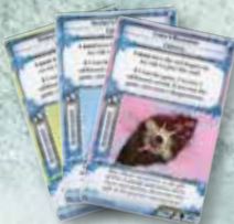
3 ACHIEVEMENT CARDS