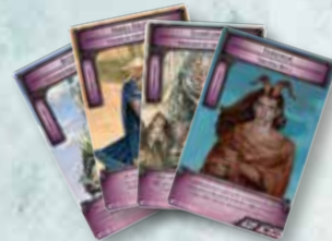
4 EMISSARY CARDS