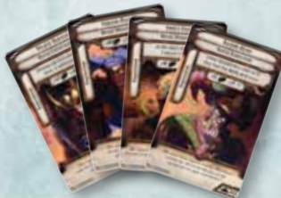
4 INQUISITOR CARDS