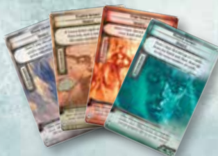
4 SPIRIT CARDS