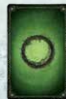
1 ELEMENT CARD