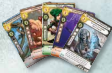
296 PEOPLE CARDS