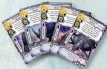
10 MUTANT CARDS