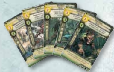
8 TUTU CARDS