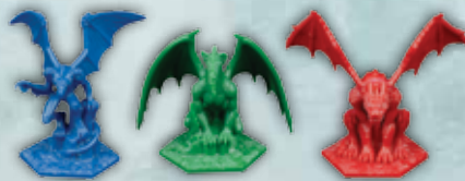
3 PLASTIC DRAGON FIGURES