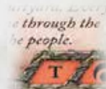
TERRAH DECK INDICATOR

When players have had enough strife and chaos, they can learn how to be more in tune with nature and the Terrah. To study with the Terrah, players prepare the game board and dragon figures as normal during setup. During the "Choose Decks" step of setup, one player takes all 31 cards with the Terrah deck indicator as his deck. The other player chooses from the Vulca, Hoax, Mimix, Flit, or Khind decks. Then, players return all unused decks to the game box and follow the remaining steps of setup as normal.