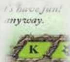
KHIND DECK INDICATOR

When players are ready for a challenge, they can attempt to rein in the Khind. To get the Khind's attention, players prepare the game board and dragon figures as normal during setup. During the "Choose Decks" step of setup, one player takes all 31 cards with the Khind deck indicator as his deck. The other player chooses from the Vulca, Hoax, Mimix, or Flit decks. Then, players return all unused decks to the game box and follow the remaining steps of setup as normal.