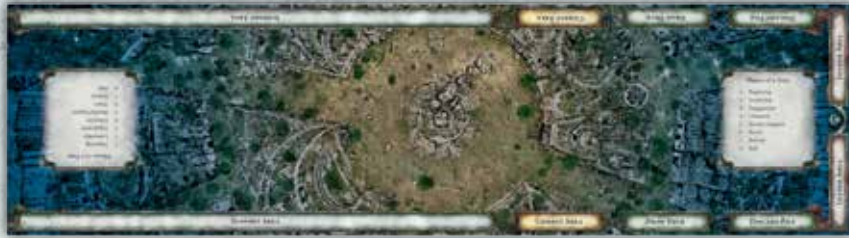
1 GAME BOARD