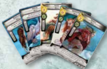
8 HYLA CARDS