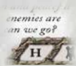
HOAX DECK INDICATOR