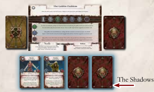
Two Faceup Enemies and Two Facedown Enemies in the Shadows

Enemies who are not engaged with a hero are in the shadows. If an enemy is in the shadows, it is in the center of the play area and is not engaged with any heroes.