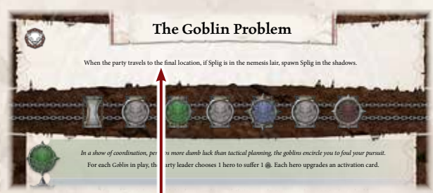
Quest Rules Box

The front of each quest sheet has special rules in a quest rules box above the peril track. It is very important for the party to read these rules before beginning a quest.