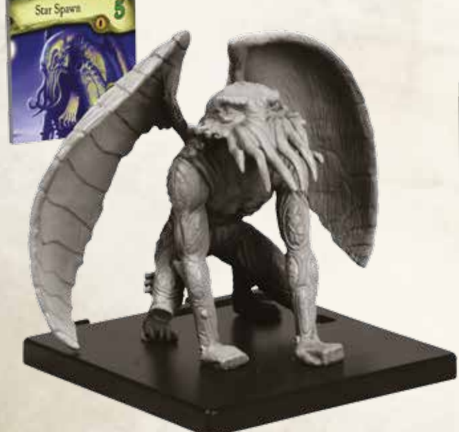
Star Spawn Figure