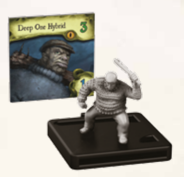
Deep One Hybrid Figure