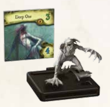
Deep One Figure