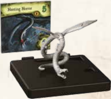
Hunting Horror Figure