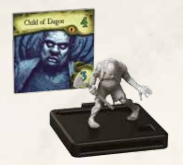
Child of Dagon Figure

After attaching each figure to its base, insert each monster token into its matching figure's base. These bases have been designed to display all pertinent information of the monster token without the need to remove the token from the base.