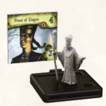
Priest of Dagon Figure