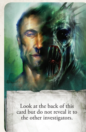
Agenda card face